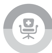
First Aid Room Treatment Chair $450